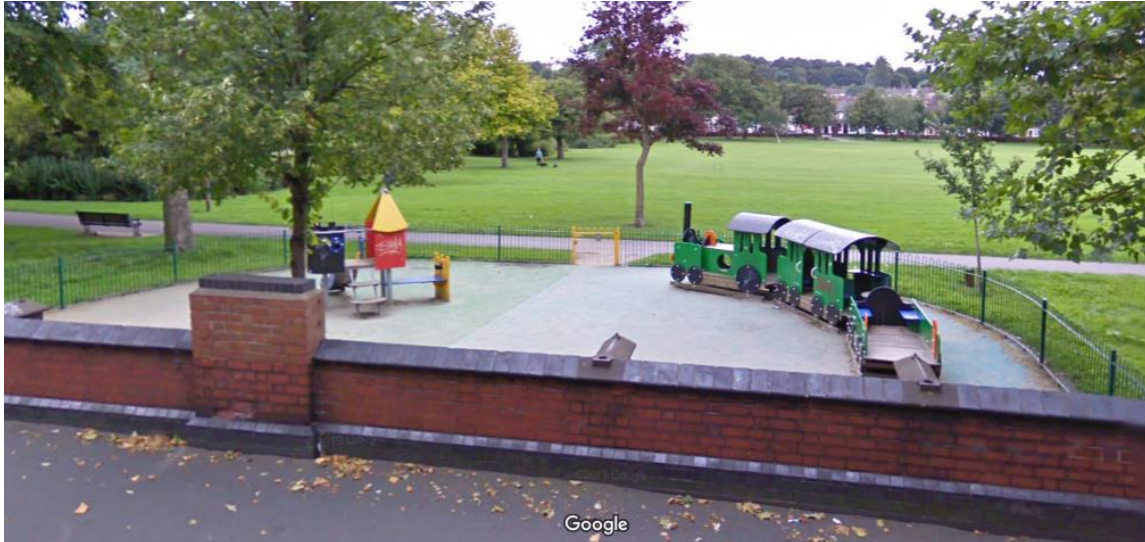
Photo taken in 2009. Play area is now showing 10 years of wear and tear since this was taken and the trees have grown.

The equipment there has extremely limited play value, the safety surface is damaged and uneven and the whole area is shrouded by trees and is therefore dark and damp.